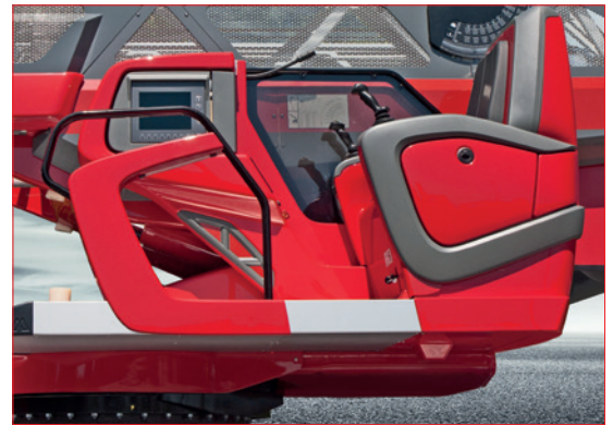
Ergonomic main control stand