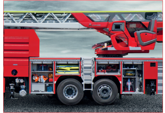
Large-volume equipment locker (exemplary loading)