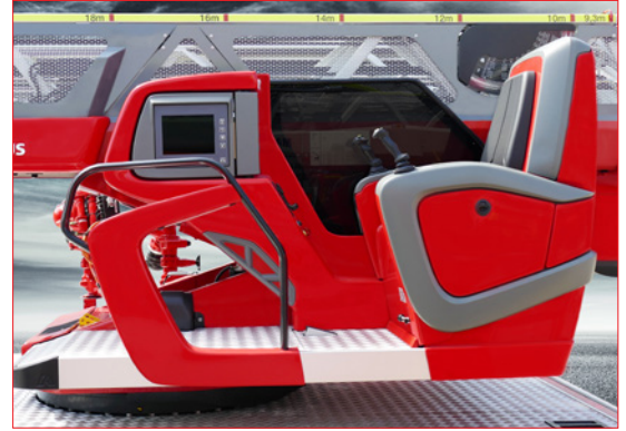
Ergonomic main control stand