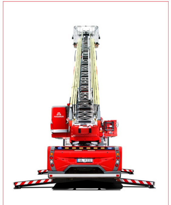
VARIO jacking system

Illustrations may include additional options. We reserve the right to make technical changes or improvements at any time without prior notice. Errors and omissions excepted.