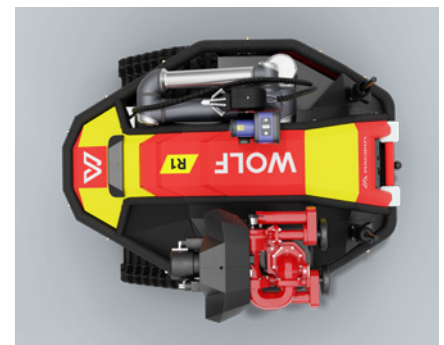
Compact, manoeuvrable, and robust: the Wolf R1 is versatile and safe to use.