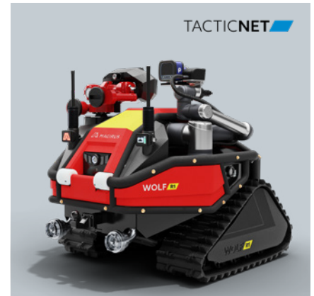
The Wolf R1, in conjunction with the TacticNet mobile operations network, offers the optimum solution for complex situations.